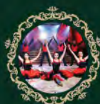
Cabaret IUNO Dance