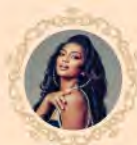
Bella Santiago Band – Vienna Lounge Show