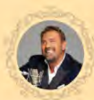
Horia Brenciu & HB Orchestra – Midnight Show in Vienna Lounge