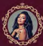
Bella Santiago Band – Vienna Lounge Show