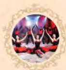
Cabaret IUNO Dance