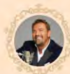
Horia Brenciu & HB Orchestra