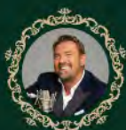
Horia Brenciu & HB Orchestra – Midnight Show in Vienna Lounge