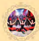
Cabaret IUNO Dance