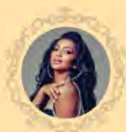
Bella Santiago Band