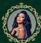
Bella Santiago Band