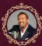
Horia Brenciu & HB Orchestra – Midnight Show in Vienna Lounge